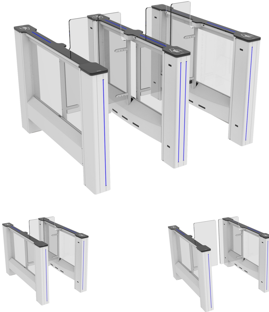
PG 03 55 / Clear Passage Width : 550 mm